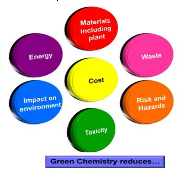
Figure 1 . Shows reducers by using green chemistry [4]

pathways (photocatalytic reaction), the goals of environmental protection and economic benefit can be achieved. This article shows examples of the prevailing trends in ways that green chemistry reduces the impact of chemical processes and technologies on the environment (Figure 1) [4]. Enhanced progress in science and technology in the second half of the twentieth century has led to important economic development and a growth in living standards. While, such economic development has caused considerable environmental degradation, which is demonstrated by more pronounced climate change, the development of ozone holes and the growth of non-destructive organic pollutants in all parts of the biosphere.